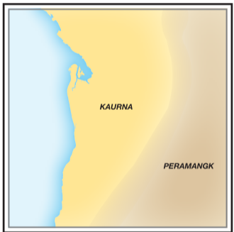
Aboriginal Language Areas The shared country concept is demonstrated by the overlapping of colours identified and neutral corridors between neighbouring language groups.